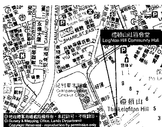
公眾研討會會場的位置 Location of the Venue of the Public Seminar

海水水質指標檢討 WQO Review 環境保護署 Environmental Protection Department 水質政策及科學組 Water Policy and Science Group 香港 灣仔 33/F Revenue Tower 告士打道 5號 5 Gloucester Road 稅務大樓 33樓 Wan Chai, Hong Kong